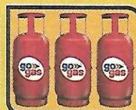
Packed Cylinder Marketing