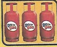
Packed Cylinder Marketing