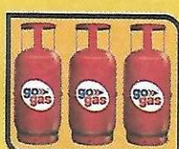
Packed Cylinder Marketing